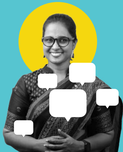
Events & Convenings Pillar