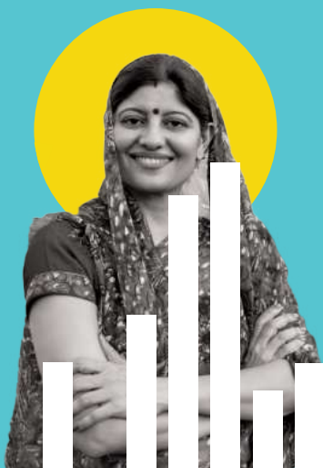
Data and Applied Research Pillar

The areas of work are supported by data backed evidence building, strengthening evidence through POCs like pilots and case studies and ecosystem enablement and institutionalising change.